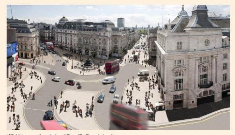
WS Atkins recently redesigned Piccadilly Circus in London

Shares in UK group rise above bid price after deal details announced